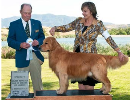
SD CH QuailwoodMountainOdessey /Piner