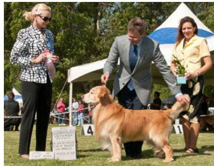
BVOS CH Woodlan'sWoofinOnTheRitz /Shilkoff,Shaphran