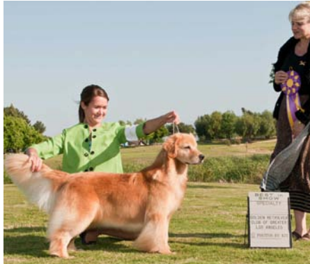
BIS GChSummitsEveryFashionVenture /Heuslein,Johnson