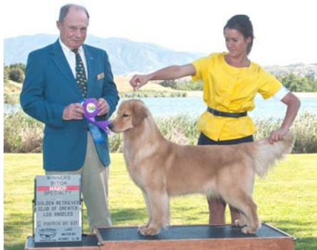
WB HytreeFeedingTimeAtTheZoo /Despins