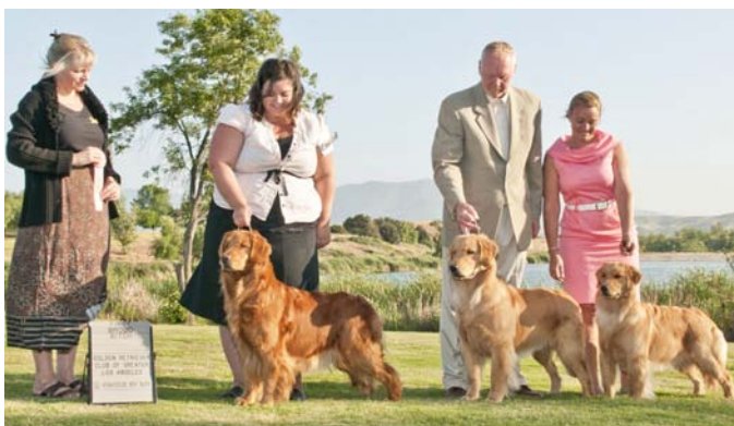
BROOD BITCH CH DalaneSeasonMagicMoment /Voss,Rowan,Jensen