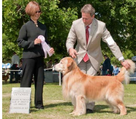
BVOS CH Woodlan'sWoofinOnTheRitz /Shilkoff,Shaphran