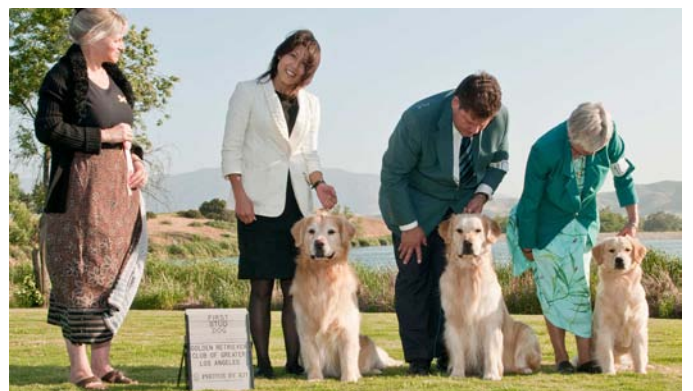
STUD DOG CH OspreyStonecrestPremiumBlend /Brothers,Bradford