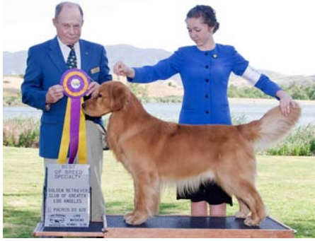
BOB/G2 CH ForeverGrandCayman /Ferkol