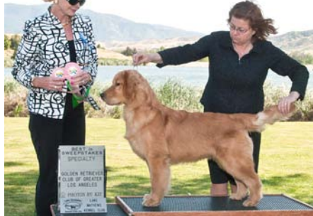
BISS CrangoldSunshine'sSkiingCrossCountry /Berry