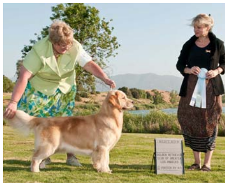
SB Verdoro'sCarpeDiem /Greenbank