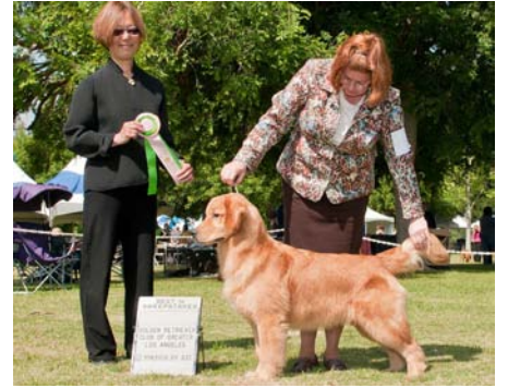
BISS CrangoldSunshine'sSkiingCrossCountry /Berry