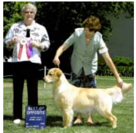
PAISLEY Paisley, Regency Goldfever Purple Haze has been trying to keep up with Abe, with RWB both days at Gavilan KC, RWB and BOS at Coyote Hills KC for her 1st point at 9-1/2 months old!