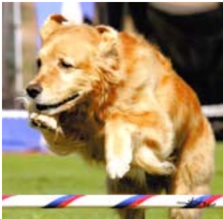
TIFFANY Tiffany, Mex/Int CH Goldfever's Diamonds Are Forever CGC, RN, NA, NAJ,OJP finished her OJP (with 1st, 2nd, & 5th) at the Fiesta Cluster in March. She's 10 years old.